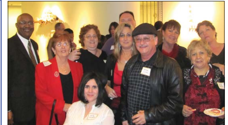
Placer Co. UDW members and staff celebrating political victories after the November 2010 general election.

UDW 800 Sunrise Ave. Suite C Roseville, CA 95661