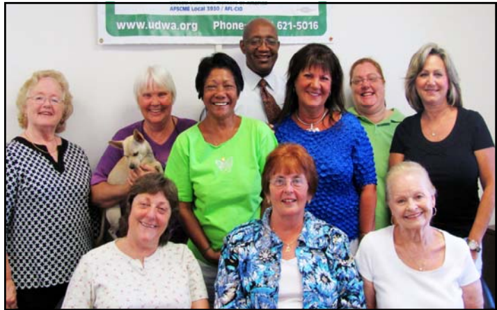
Placer County E-Board Members and Newsletter Committee

If you are interested in forming a support group, please call